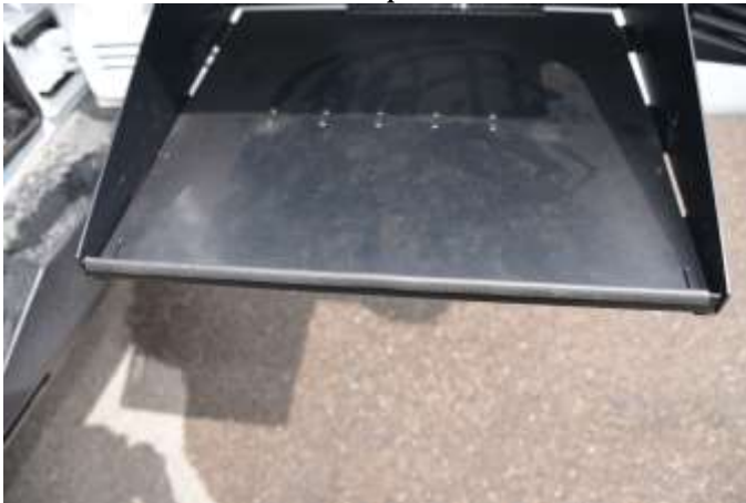
Rubber strip installed