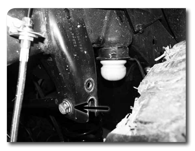
Figure 3 - LHD Shown